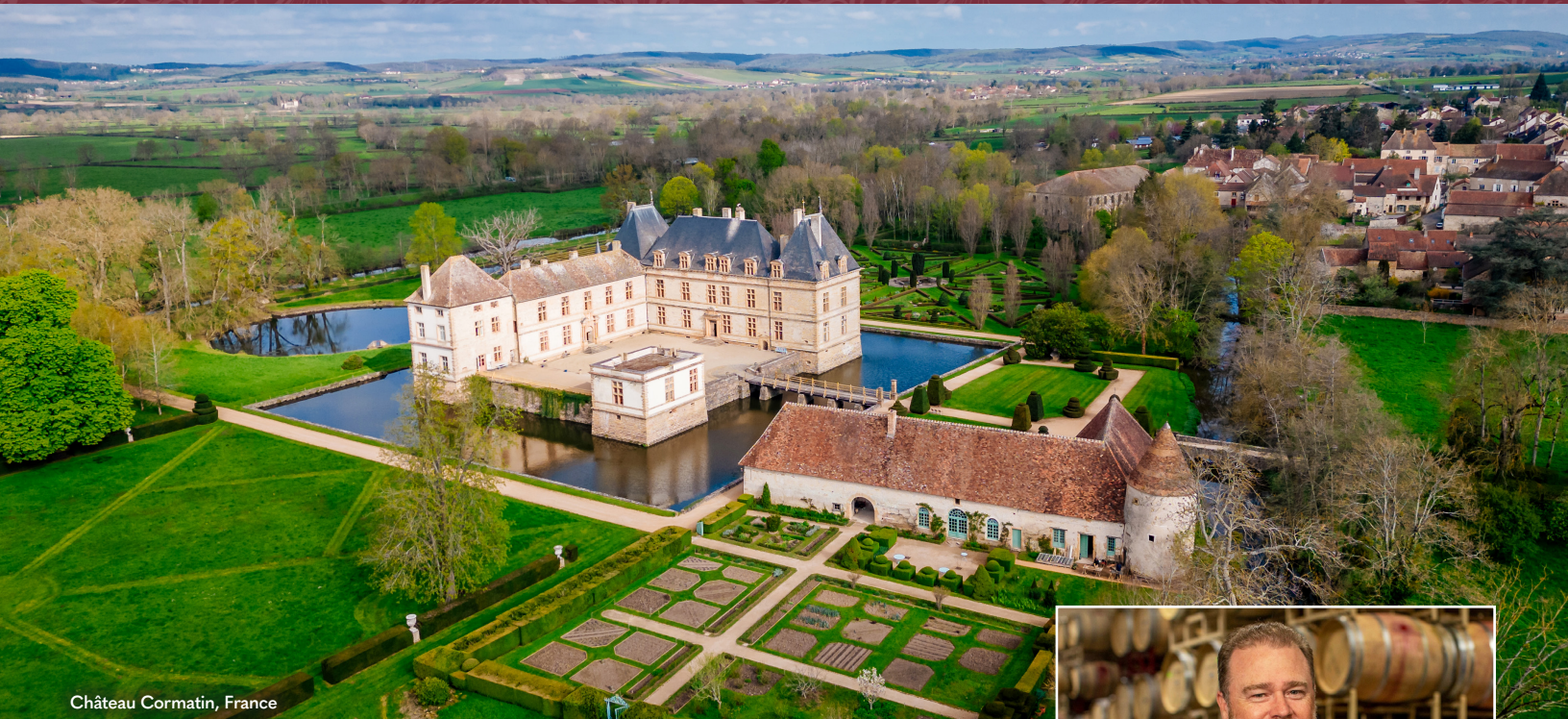
Château Cormatin, France

UNCORK LOCAL TRADITIONS, SAVOR INTENSE FLAVORS AND ENJOY PALATE-PLEASING ADVENTURES DURING AN AMAWATERWAYS WINE CRUISE